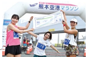
The prize for participating is a custom-designed towel! Why not consider taking the challenge next time?

The runway at Aso Kumamoto Airport has a height difference of about 12 meters from east to west. The east side is approximately 12 meters higher than the west, which is equivalent to a four-story building. The incline on the runway raises the runners' heartbeat.