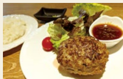
▲Plump and succulent Kinkaku Burger Steak without additives (150g/ ¥1,780) + Rice (¥200)

Kakunoshin Burger Steak, which opened in late April at Aso Kumamoto Airport, takes pride in its Kinkaku Burger Steak. This burger steak is crafted using Japanese beef, Hakinton pork from Iwate, koji marinade, and binder. There are three ways to enjoy it! Firstly, savor the umami of koji marinade and meat on its own, then enhance the flavor with salt and wasabi, and finally, try it with the Japanese-style sauce combined with ponzu made from Kumamoto ingredients. Alongside the Kinkaku burger steak, they also offer a Kunkaku burger steak smoked at a low temperature. They serve a harmonious blend of Iwate and Kumamoto culinary delights, including Kumamoto's Hinohikari rice and draft beer directly from the Suntory Kyushu Kumamoto brewery.