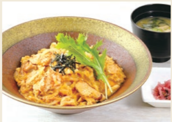
◀Grilled Amakusa Daio Chicken Oyakodon is made with chicken raised in Kumamoto ¥1,789 (incl. tax)