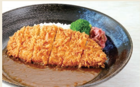
▲Mont-Vert Pork Loin Katsu Curry ¥1,848 (incl. tax) Succulent katsu and beloved curry are a match made in heaven!

Royal Host aspires to be a beloved dining destination renowned for its welcoming service within the local community. The menu features not only classic Western delights like burger steak and omu-rice but also a selection that highlights local ingredients, setting Royal Host apart. Guests can enjoy a delightful drinks bar and tempting desserts, including sundaes. Particularly at the Kumamoto Airport branch, patrons will discover exclusive offerings such as katsu curry and steak crafted from Mont-Vert Pork, sourced from the verdant mountains of Minamata. Additionally, you can indulge in specialties like oyakodon, made with the local Amakusa Daio chicken, chikuwa salad, and karashi renkon, which are lotus roots filled with mustard. The extraordinary flavor emerges from the harmonious blend of thoughtfully chosen ingredients following the "Royho" approach.