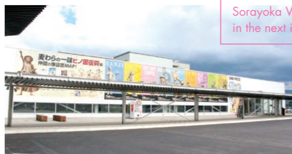
Sorayoka Visitor Center

Following the earlier openings of Po-Tama, Kakunoshin Burger Steak, and Royal Host, Suganoya and Milksha ft. Ichiryuniji 1624 will debut in November. The expansion of the restaurant area will allow customers to select from a variety of options to meet their specific needs, whether they want to take out or dine in.